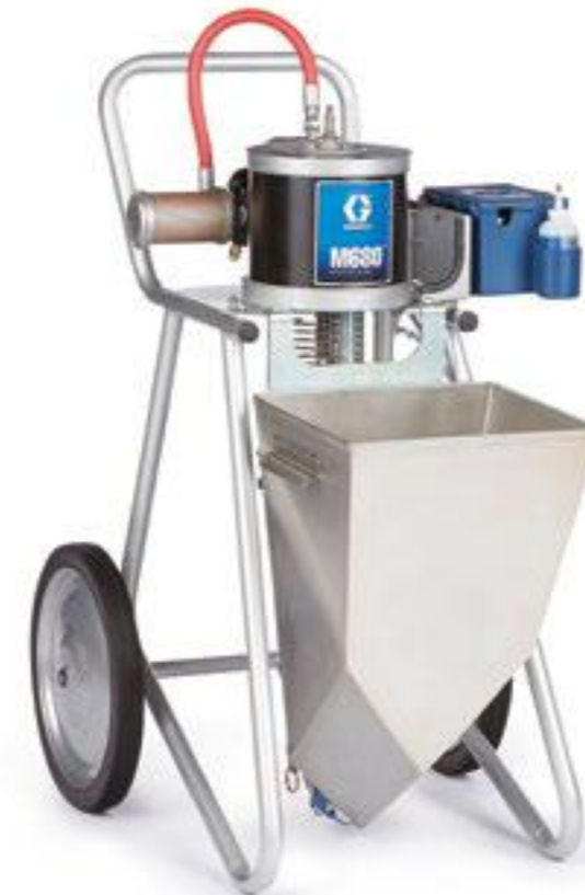
ToughTek M680a CS

The ToughTek M680a piston pump handles abrasive materials such as epoxy mortars, non-skid coatings (bridges and marine industry – solvent based coatings) or cementitious materials, and tackles difficult polymers with fillers such as glass flake, silica or sand. The all stainless design makes cleanup of epoxy mortars easy and worry-free.