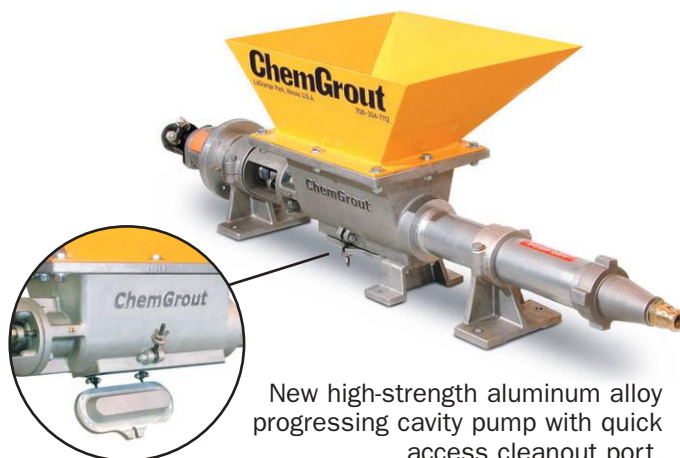
New high-strength aluminum alloy progressing cavity pump with quick access cleanout port.

Tunneling Well Drilling Geotechnical Construction Mining Municipal Restoration Highway